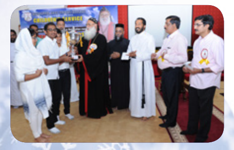
ECUMENICAL BIBLE QUIZ - CS