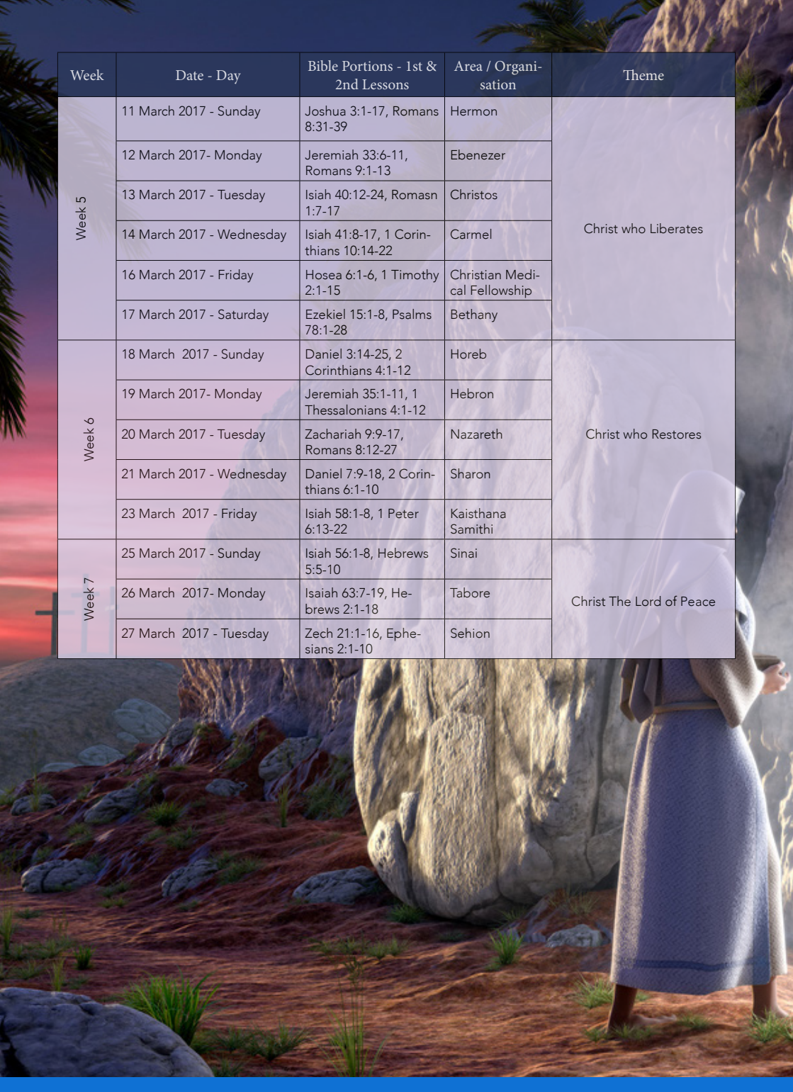
P.O. Box. 19264, Doha - Qatar, Telephone: 44165701/44165702