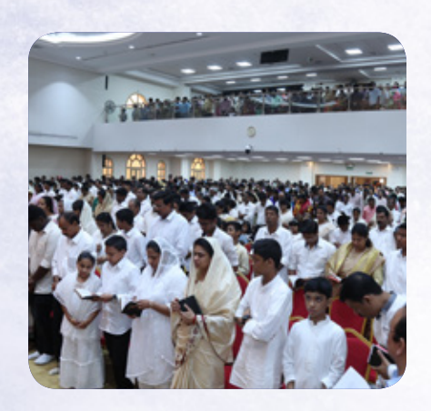
KUDUMBA DINAM - CHURCH