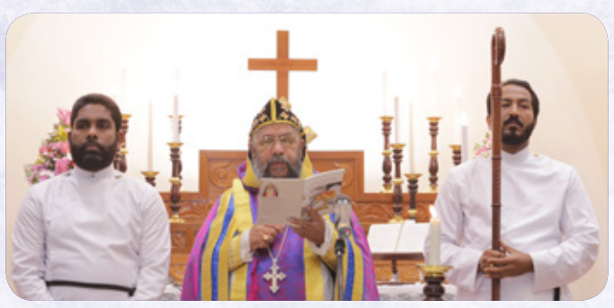
KUDUMBA DINAM - CHURCH